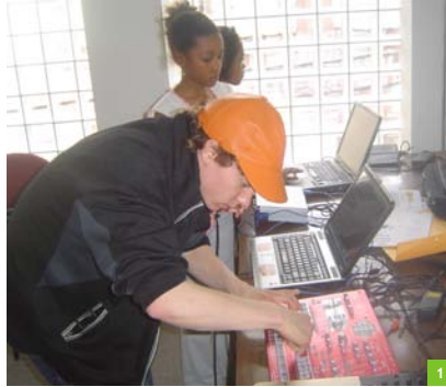
The best victory for the students was being able to experience the rewards of all their hard work. Although their hard work and preparation did result in a successful event, the students soon began to learn that being a leader is not always fun.

Each student put together outfits to express his/her individual sense of style. The show was a huge success. In addition to fully expressing themselves in their unique styles, the young leaders also managed their rehearsal times, practiced their lineups and organized