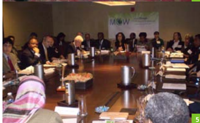
Opp Show for MCW