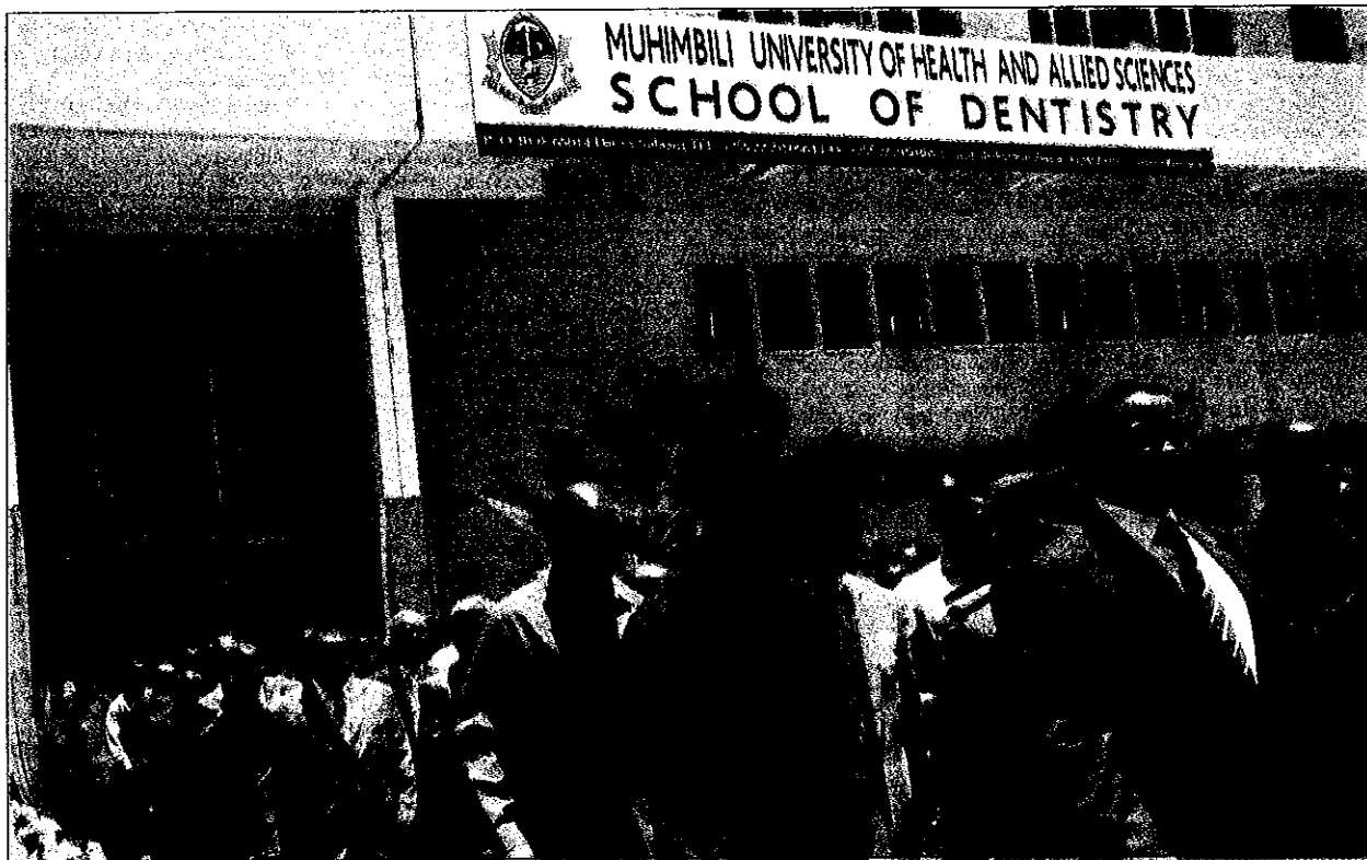
President Jakaya Kikwete (in forefront) in company of other government leaders comes out of the dental unit building at the Muhimbili Medical University and Allied Sciences after the launch of the building yesterday.

He said before the donation was made, the country had no emergency Cont. Pg 2